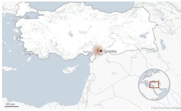
A 7.8 magnitude earthquake shook central Turkey early Monday and was followed by strong aftershocks.