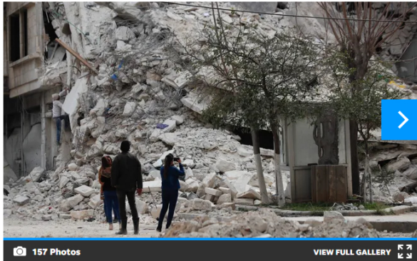
157 Photos VIEW FULL GALLERY