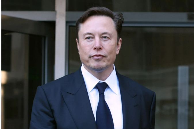
Elon Musk on January 24, 2023 in San Francisco, California.

OVER 1,400 TECH leaders and academics including Elon Musk , Apple co-founder Steve Wozniak and Pinterest co-founder Evan Sharp have signed an open letter calling on Artificial Intelligence developers to pause training of some of their more sophisticated AI experiments, citing risks they claim could result in "loss of control of our civilization."