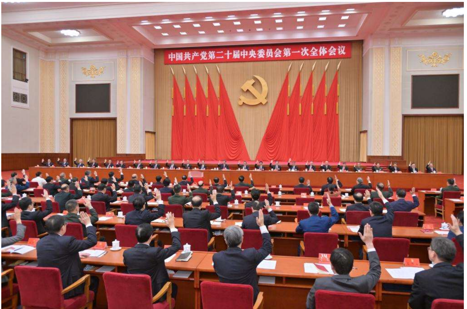
The 20th Central Committee of the Communist Party of China (CPC) holds its first plenary session at the Great Hall of the People in Beijing, capital of China, Oct. 23, 2022.