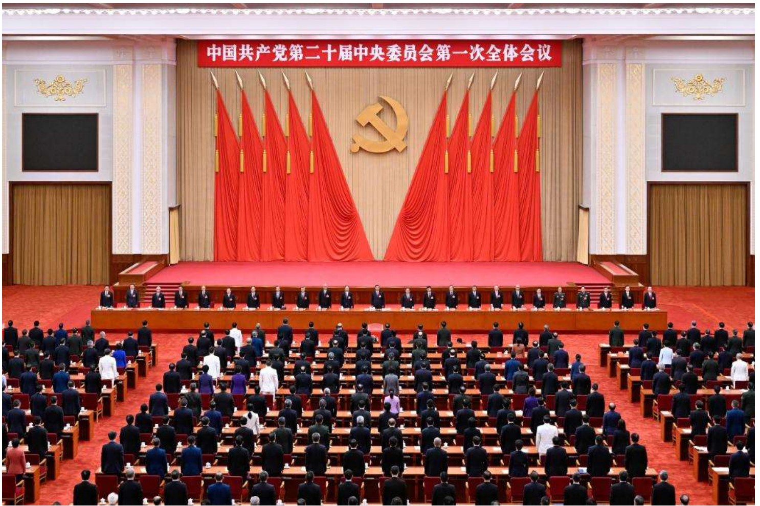
The 20th Central Committee of the Communist Party of China (CPC) holds its first plenary session at the Great Hall of the People in Beijing, capital of China, Oct. 23, 2022.